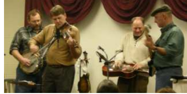
Creek Bend Bluegrass performs in 2008.

Finally.....it is almost time for our Finally Fridays series to begin. This will be the 9th year that this popular series has been underway, entertaining music lovers from around Orleans, Genesee, and Niagara counties. All free programs begin promptly at 7:00. No registra-